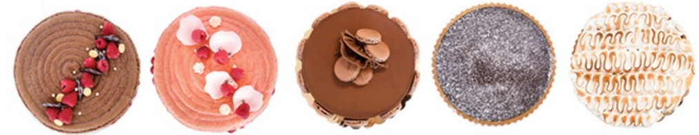
Chocolate Raspberry Macaron Cake Rose Lychees Macaron Cake Chocolate Alcazar Birthday Cake Chocolate Coconut Tart Lemon Meringue Pie